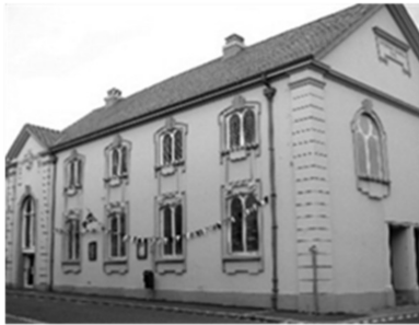
CORNERSTONE CHURCH, 15 FORE STREET, TORPOINT, CORNWALL, PL11 2AB

LOOP SYSTEM INSTALLED FOR HARD OF HEARING